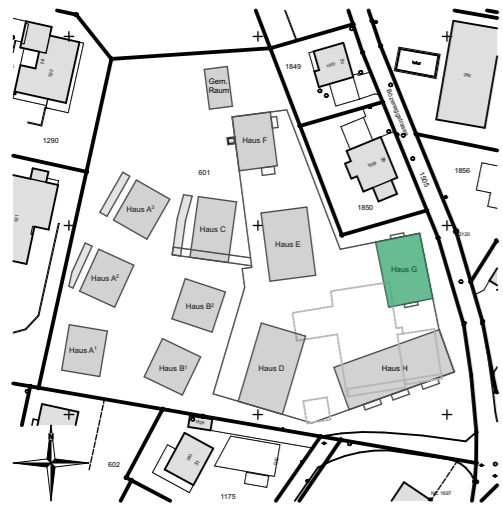
Situationsplan Mst. 1:2000